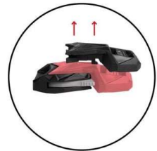
LIFT THE BUCKLE UPWARDS