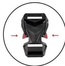
SQUEEZE BOTH CLIPS