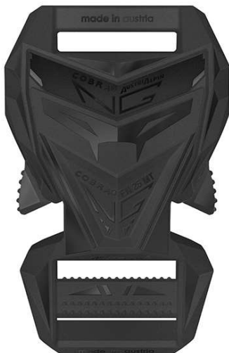
COBRA®NG QUICK RELEASE

The ENFORCE TAC is the ideal place to take a close look at AUSTRIALPIN innovations such as our brand-new COBRA®NG QUICK RELEASE . This safety buckle, equipped with an innovative triple lock system, is made of high-strength polymer. Its special design makes it extremely robust and resilient.