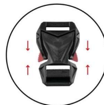
PRESS THE BUCKLE